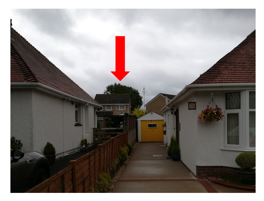
View 6: TPO 629 T1, Viewed from Riversdale Road