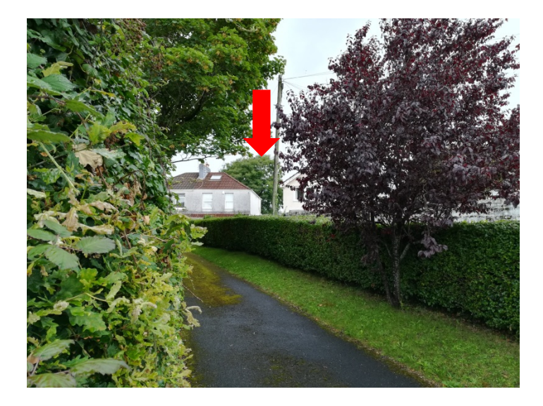
View 3: TPO 629 T1, Viewed from Hadland Terrace