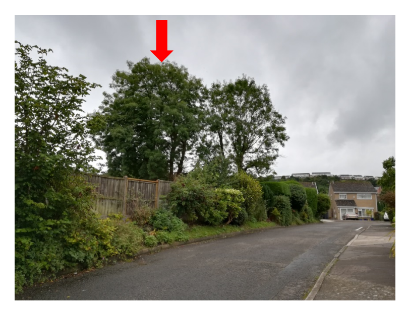
View 2: TPO 629 T1, Viewed from Woodburn Drive