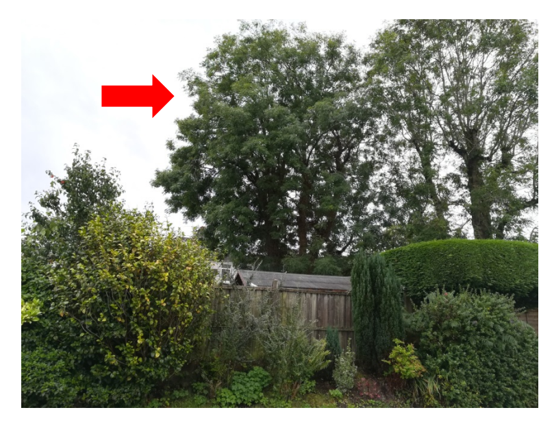
View 1: TPO 629 T1, Viewed from Woodburn Drive