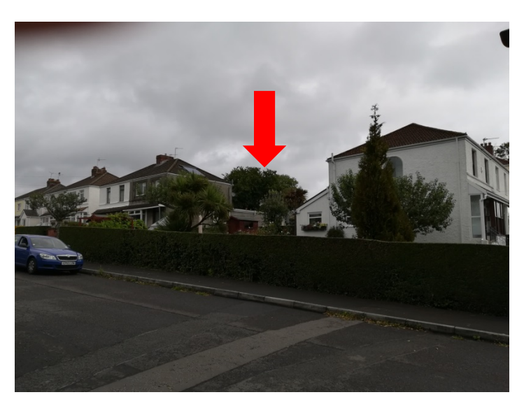
View 4: TPO 629 T1, Viewed from Bude Haven Terrace