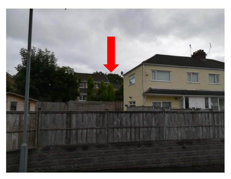
View 5: TPO 629 T1, Viewed from Bude Haven Terrace